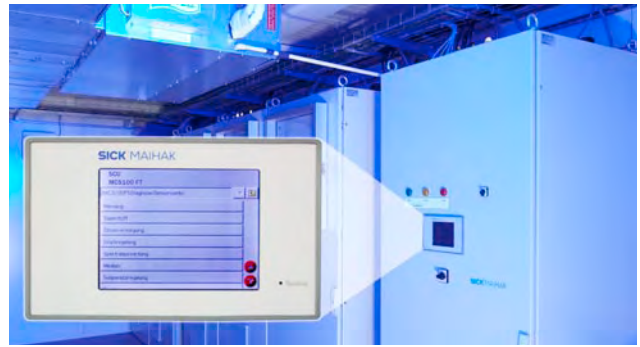
Touchscreen operating unit on-board